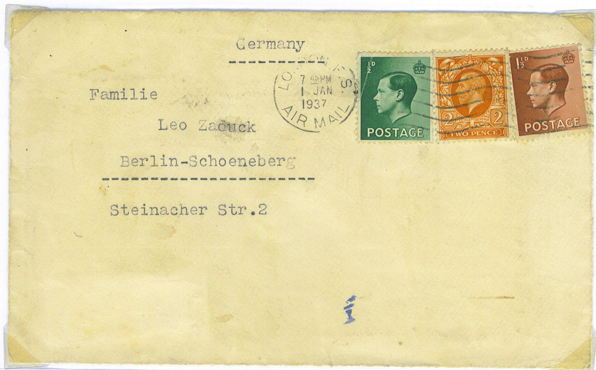
4d rate to Germany, including an earlier 2d stamp, there being no 2d Edward VIII stamp.