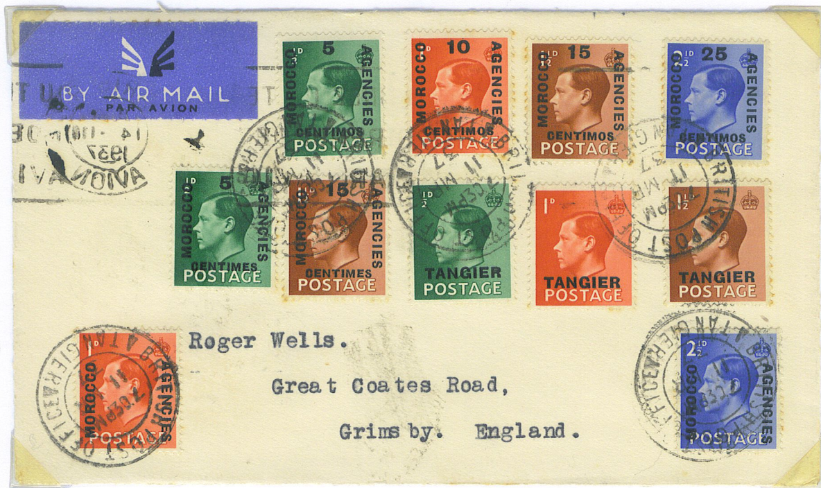
Two covers, each posted in Tangier, carrying each of the Postal Agencies' stamps for Morocco and Tangier.