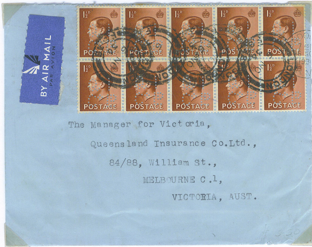
10 x three halfpence value, each with the perfin Q I Co Ld for Queensland Insurance Co Ltd.