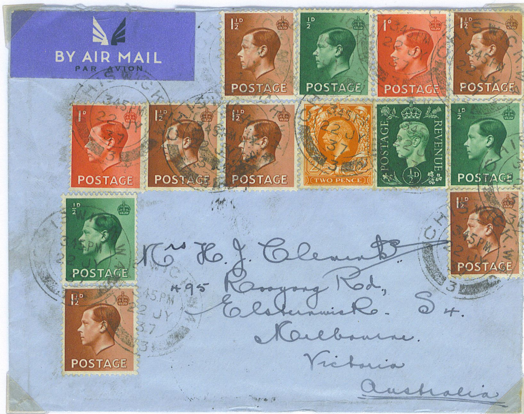
Airmail rate, including stamps from preceding and succeeding monarchs.