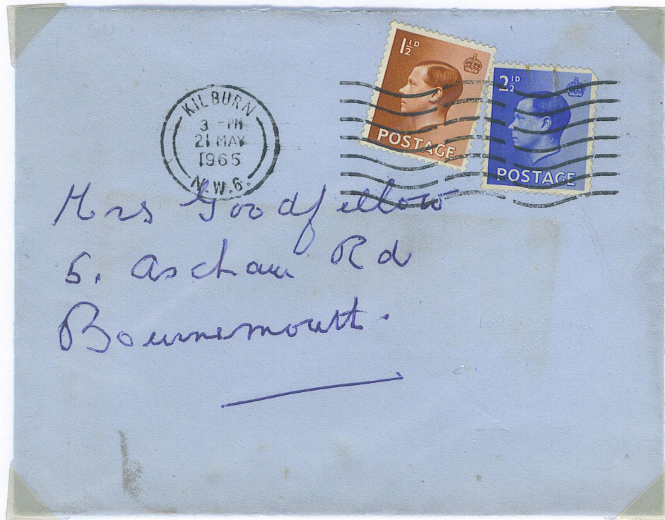
Stamps issued 1936, still validated and used in 1965.